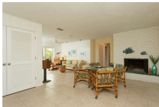
Walls from a 4th bedroom were removed to make more casual living space in this home.

space again, and many of the Broadwater renovations have removed walls, or taken down the kitchen walls above counter level. This makes for a seemingly larger space and a 1,700 sq ft home can be quite