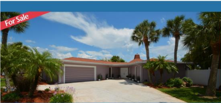
3900 46th Avenue S 3BR | 2BA | 2,254 SF Listed at $650,000