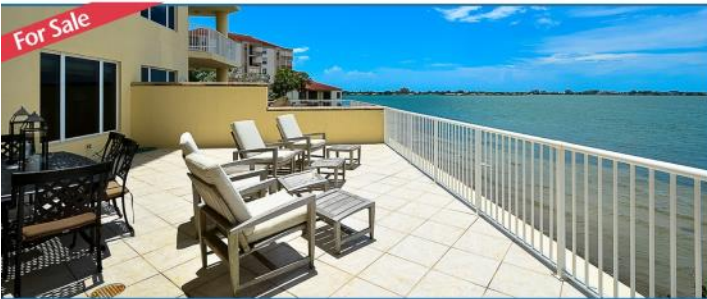
6025 Sun Boulevard #102 3BR | 3/1BA | 2,195 SF + 800 SF Lanai and Open Water View Listed at $825,000