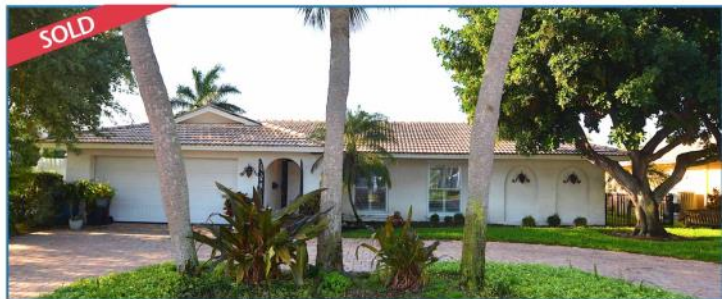
4300 48th Avenue S 3BR | 2BA | 1,803 SF Sold for $635,000